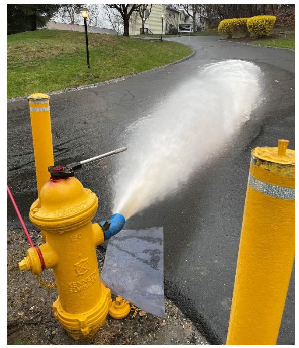
Hydrant flushing is performed each Spring to improve water quality and fire protection.

systems. The State Health Department's and the FDA's regulations establish limits for contaminants in bottled water which must provide the same protection for public health.