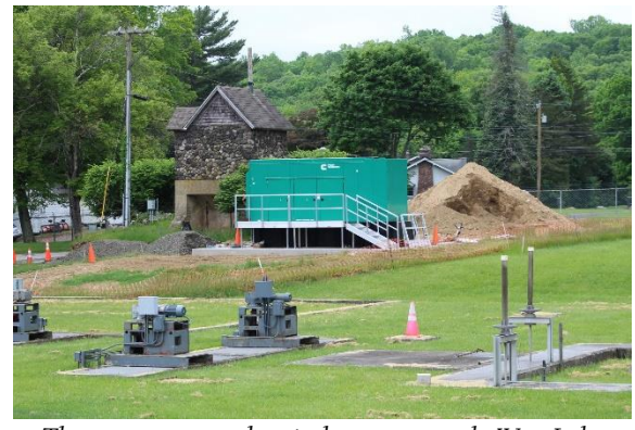
The new emergency electrical generator at the West Lake Treatment Plant will satisfy the critical backup power needs for decades to come

Other improvements began in 2021 were updates to piping and valves at the WestConn Pump Station that feeds parts of the west side of town, and the planning for upgrading a key component of the water treatment process at the West Lake Plant, the filtration systems. Both of these projects are also expected to be done in 2022.