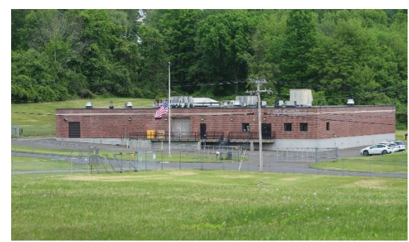
The Margerie Water Plant was completed in 1998 & produces about 3 million gallons a day, half of the City's supply

Various treatment processes used in the water industry are designed to remove potentially harmful contaminants. Reservoir water is treated at our two water treatment facilities: the West Lake and Margerie Water Treatment Plants. The first step in treatment is chemical addition of aluminum sulfate to the water in order to remove a majority of the impurities. Removal is accomplished by settling or floating of the impurities in tanks at the treatment plants, followed by filtering out microscopic particles through sand or carbon. Disinfection of the water is done to kill disease-producing organisms that may be present, accomplished by chemical treatment with liquid chlorine to the filtered water. Final treatment includes fluoride addition to prevent tooth decay. phosphate addition to reduce pipeline corrosion, and caustic soda addition to adjust the pH to neutral.